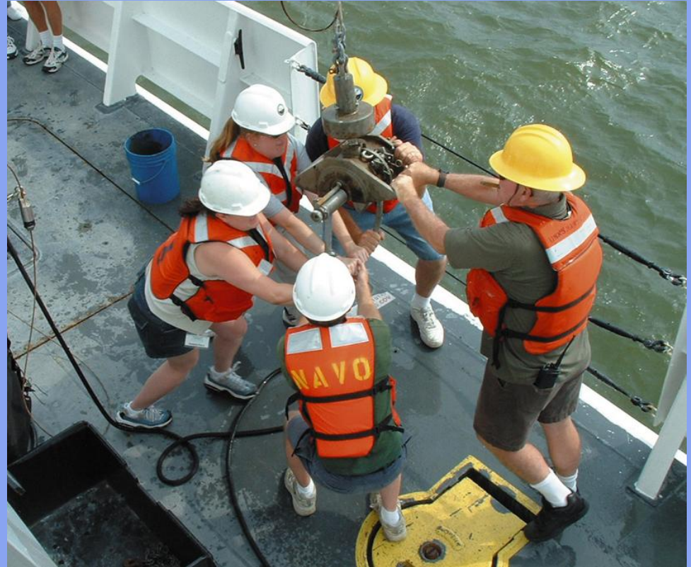
Central Gulf of Mexico COSEE/U.S. Navy

Scientists and educators working together to advance ocean discovery and make known the vital role of the ocean in our lives.